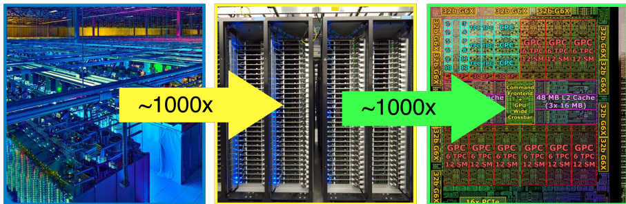
Figure 1.1: Society depends on datacenters to keep running, and therefore we cannot afford to let these systems break down or experience significant performance-related issues. With millions of servers in the largest datacenters, real-time management becomes very difficult. Left to right: a Google datacenter, server racks, Ada Lovelace AD102 GPU architecture.

Heterogeneous datacenter architectures are common [8] and modern computational needs of AI drive managers to diversify datacenters even more [1]. In result datacenters become extremely complex and hard to operate with millions of CPU's, GPU's etc.